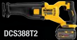
DCS388T2 60V MAX* Brushless Recip Saw