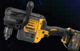
DCD460T2 60V MAX* VSR™ Stud and Joist Drill Kit w/ E-Clutch® System