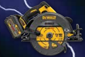
DCS575T2 60V MAX* 7-1/4" Circular Saw w/ Brake